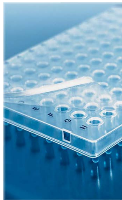
96-well PCR plates from VWR and PCR sealing films from BRAND: A perfectly matched solution for your laboratory!

Summary: It makes sense not to use just any system of plates and films, but those which have proven to be well matched to each other!